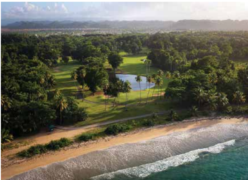
Dorado Beach Resort