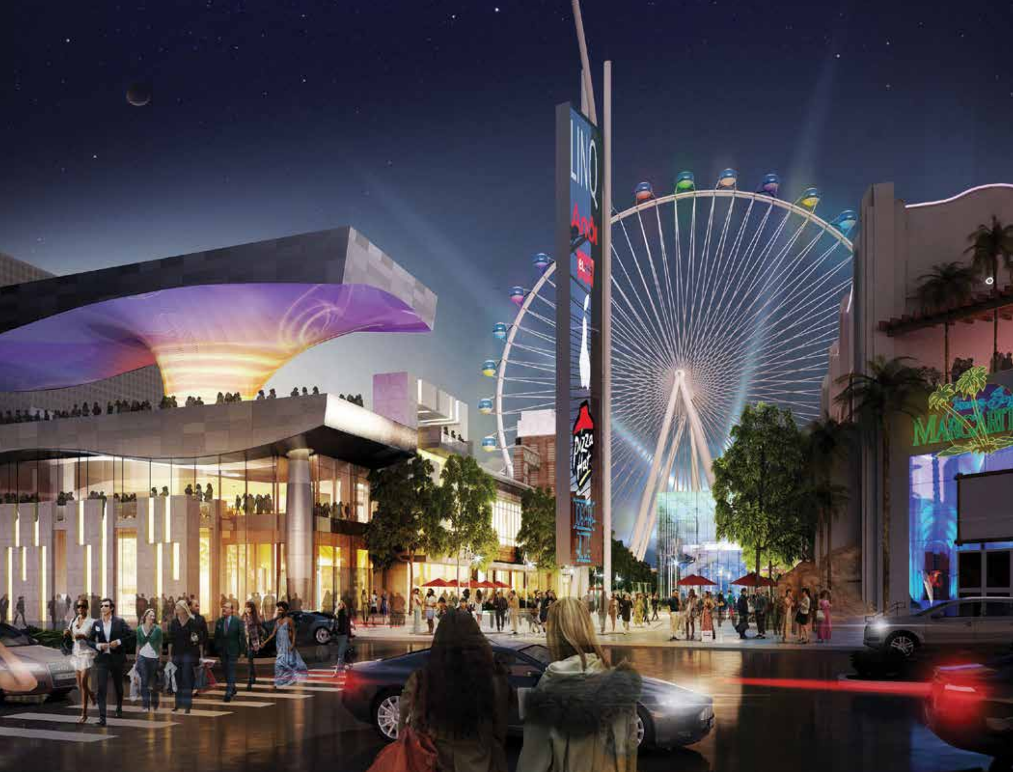
LINQ High Roller, Las Vegas - Caesars Entertainment Corporation