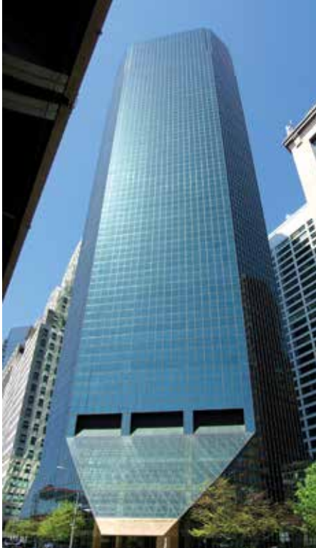
180 Maiden Lane