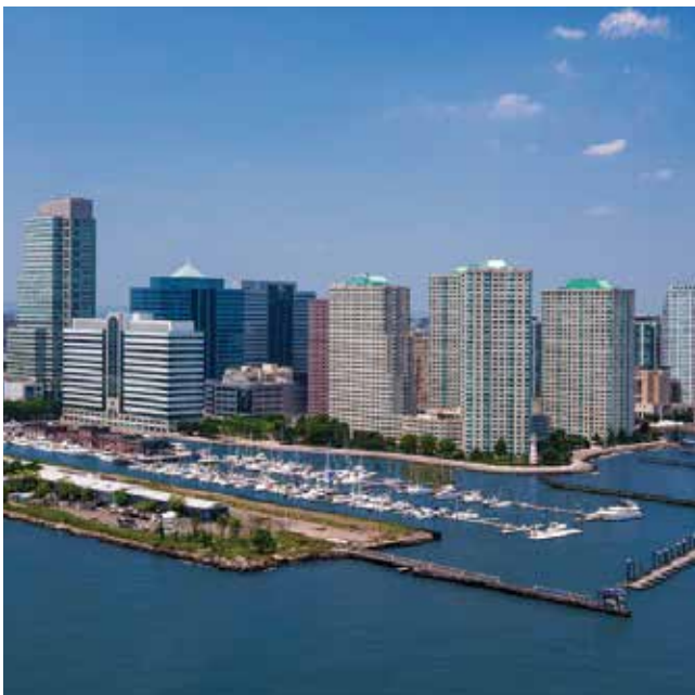
Newport Associates Development Company