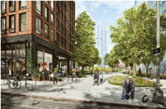
Greenland Forest City Partners