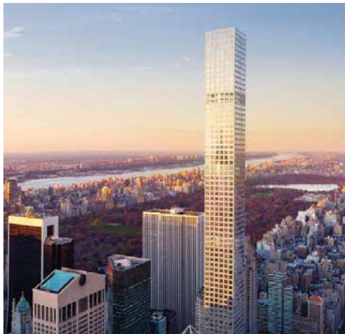
432 Park Avenue