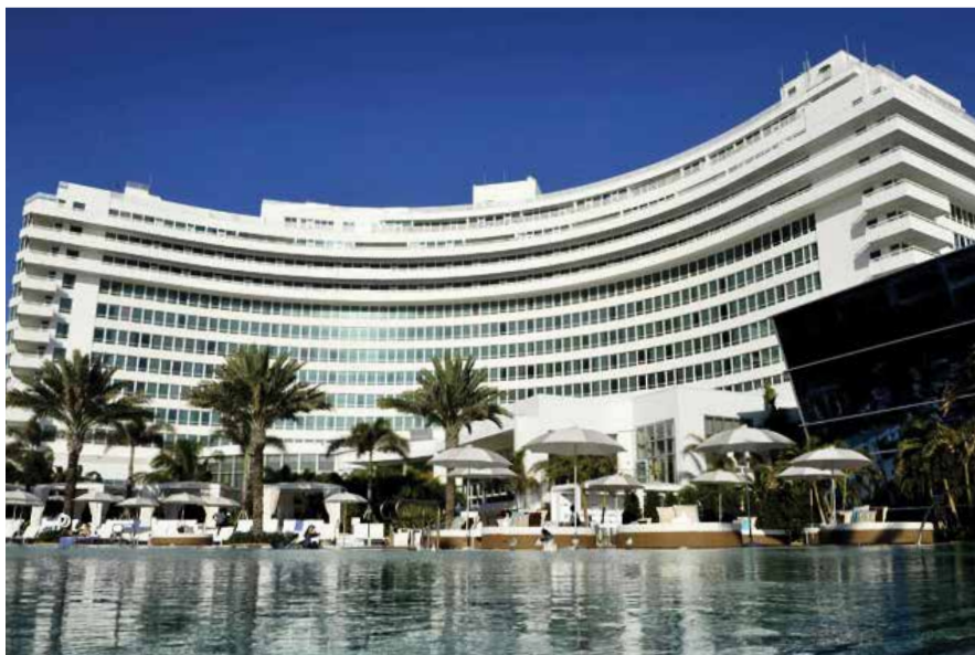
Fontainebleau Miami Beach