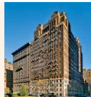
737 Park Avenue