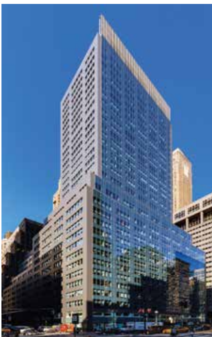
100 Park Avenue