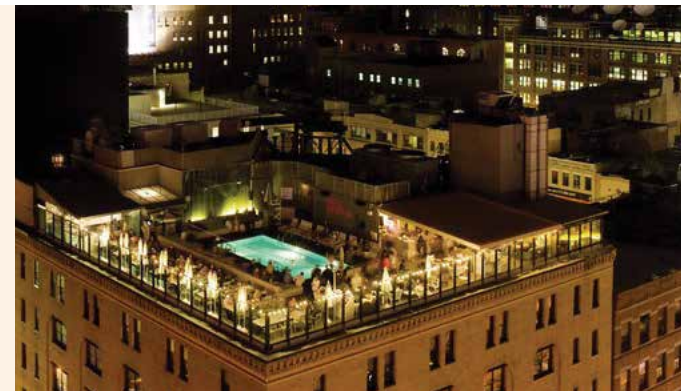
Soho House New York

We represented the Yucaipa Companies in the sale of the commercial condominium unit that houses the Soho House New York, located at 33 Ninth Avenue, and the modification of the Soho House lease in connection with such sale.