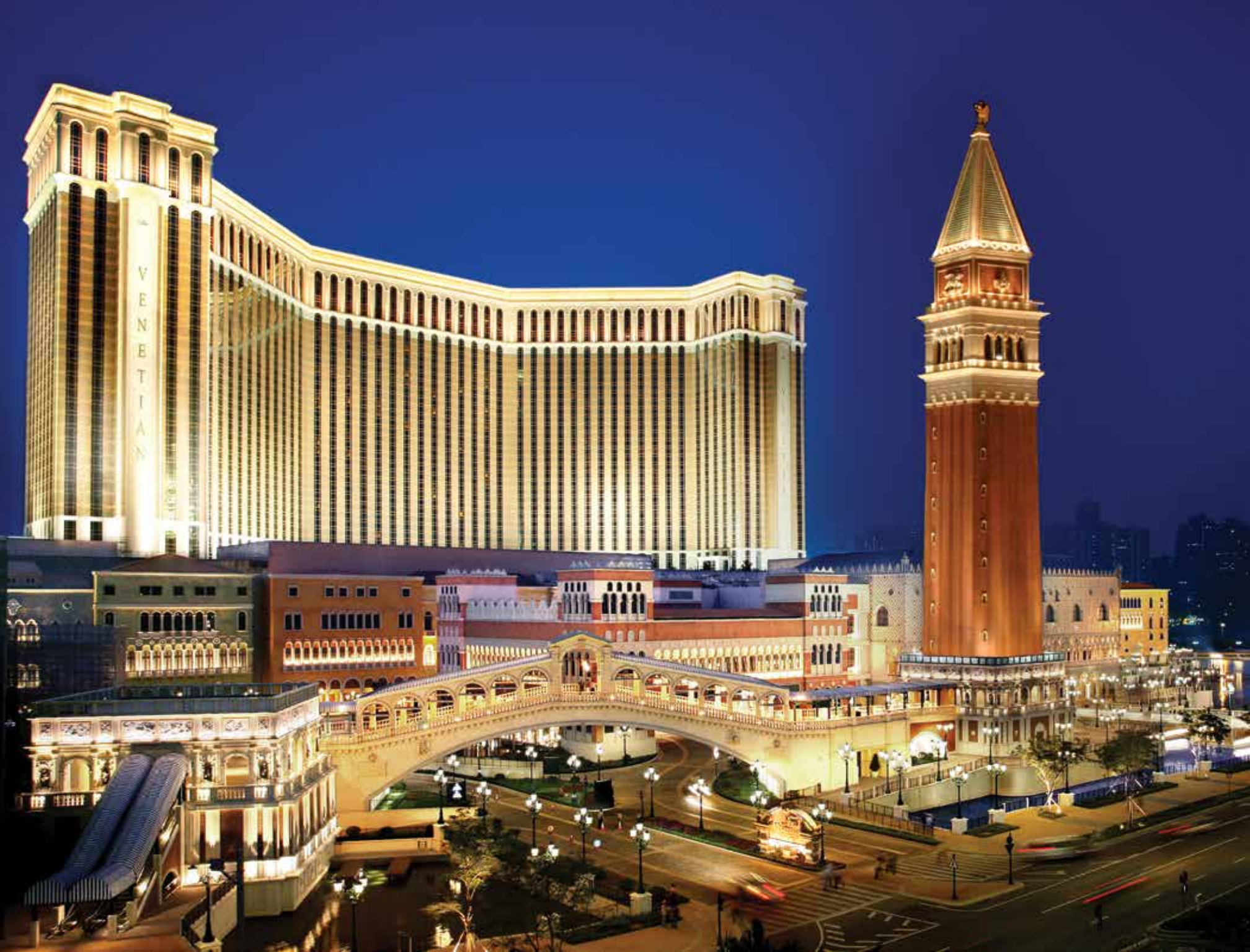
Venetian, Las Vegas - Las Vegas Sands Corp.