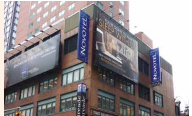
Novotel New York Times Square

We represent Apollo Global Management in a joint venture with Chartres Lodging Group and other investors, to sell the Novotel New York Times Square, located in the heart of Manhattan's theater district, to Millennium & Copthorne Hotels plc, a publicly traded UK-based hotel operator, for approximately $274 million.