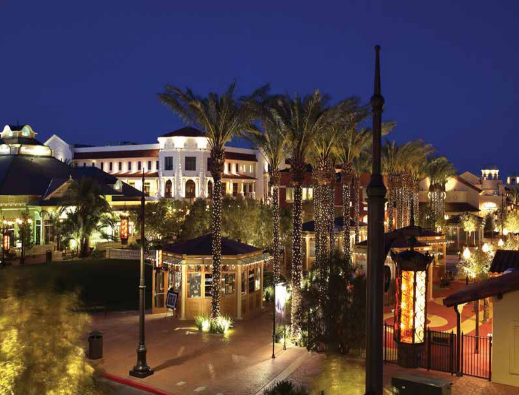
Town Square Las Vegas