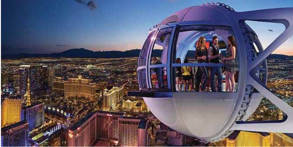
LINQ High Roller, Las Vegas - Caesars Entertainment Corporation